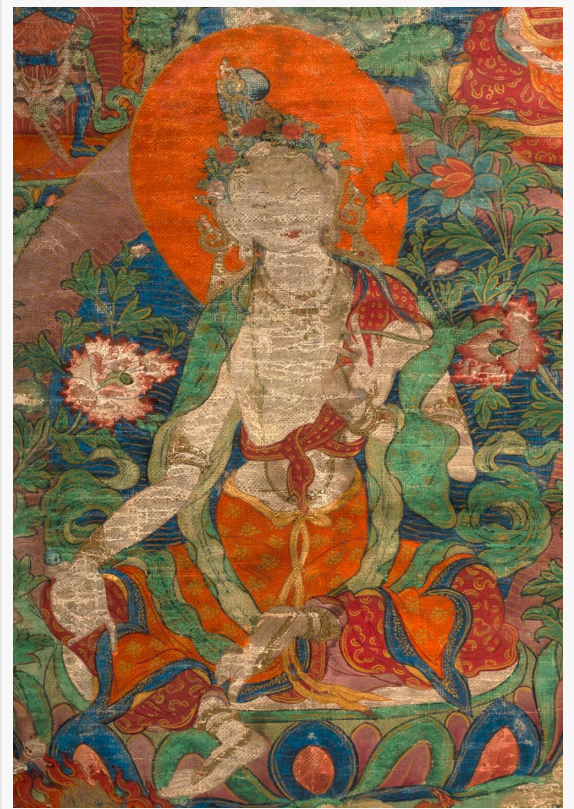
18th-century CE thangka with depiction of White Tara Bodhisattva surrounded by Buddhist deities, Tibet, distemper on cloth, gilt frame. Exhibited in 2006-2009 traveling exhibition of Anthony Quinn collection. Estimate $5,000-$8,000

Learn more about the Anthony Quinn Foundation at aqfoundation.org .