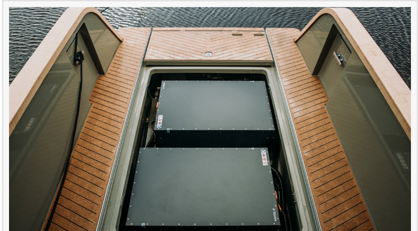
KBP63 in Eelex 8000

RAINBACH, AUSTRIA, February 21, 2022 /EINPresswire.com/ -- X Shore , the award-winning Swedish technology company behind a game-changing generation of 100% electric boats, has taken onboard Kreisel Electric , the global leader in battery innovation, in a 5-year deal worth €50 million.