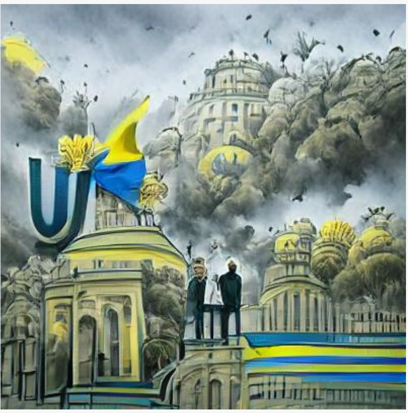
Ukraine Withstands All