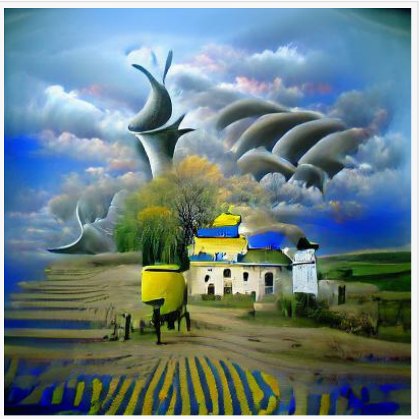
Ukraine the Beautiful NFT