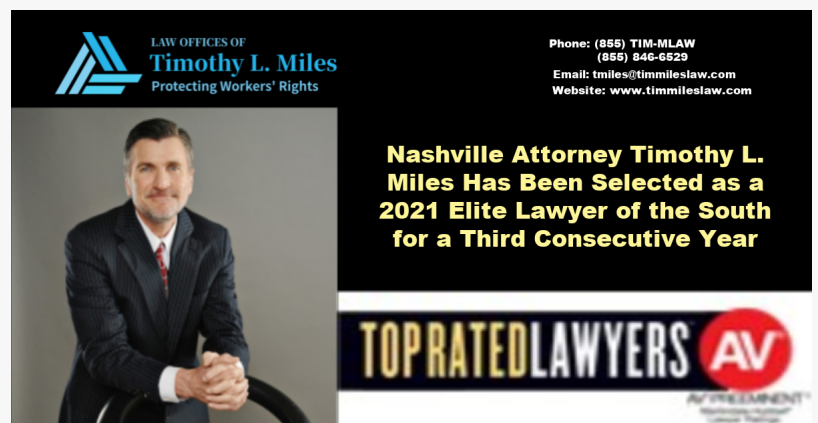
Nationally Recognized Shareholder Rights Attorney