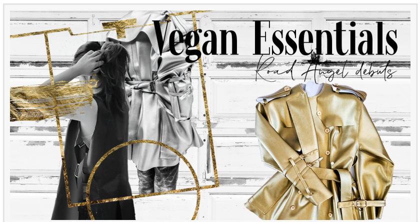
Road Angel: the first to present plant-based leather styles made on demand, curating everyday wardrobe for sustainable future.

HONG KONG, February 22, 2022 /EINPresswire.com/ -- Embracing a vision of lasting style, <u>Road Angel</u> debuts a new fashion alliance to accompany the courageous and determined: Golden Armour, a trench statement at all times, and Black Knight the vest. Tailored with Desserto cactus vegan leather, the style essentials are