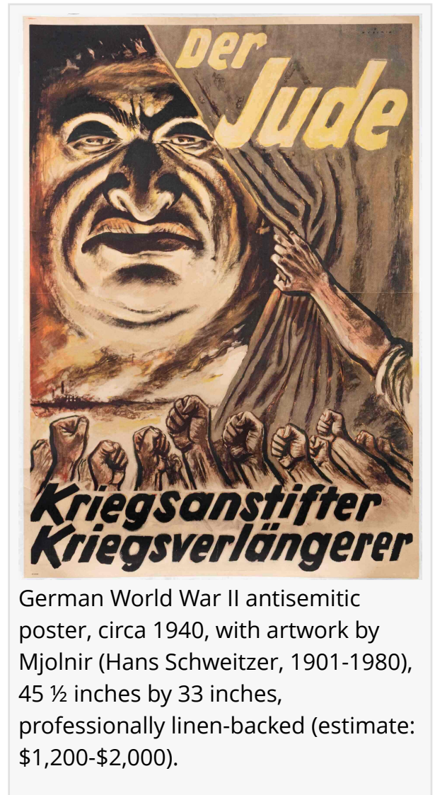
German World War II antisemitic poster, circa 1940, with artwork by Mjolnir (Hans Schweitzer, 1901-1980), 45 ½ inches by 33 inches, professionally linen-backed (estimate: $1,200-$2,000).

Fairhill Auction serves clients who buy and sell historical collectibles at auction. The firm offers consignment services for individuals, appraisers, estates and trusts, serving collectors worldwide. The auctions feature historical militaria from World Wars I and II, general militaria, documents and relics, historical autographs, ephemera, photographs, posters and objects of history and art.