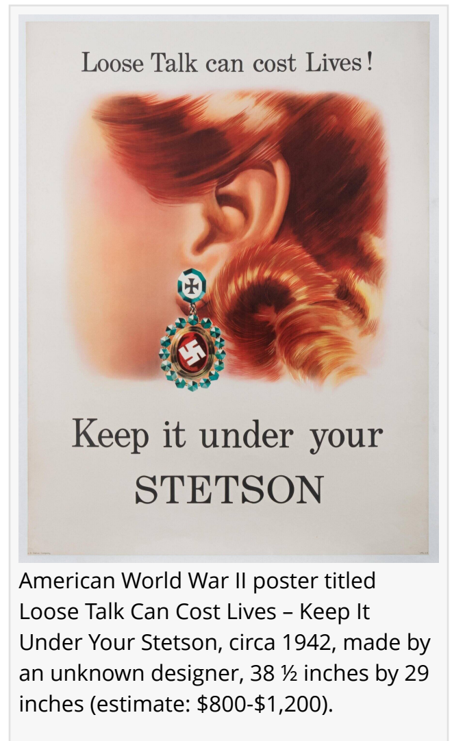
American World War II poster titled Loose Talk Can Cost Lives – Keep It Under Your Stetson, circa 1942, made by an unknown designer, 38 ½ inches by 29 inches (estimate: $800-$1,200).

This press release can be viewed online at: https://www.einpresswire.com/article/563771885