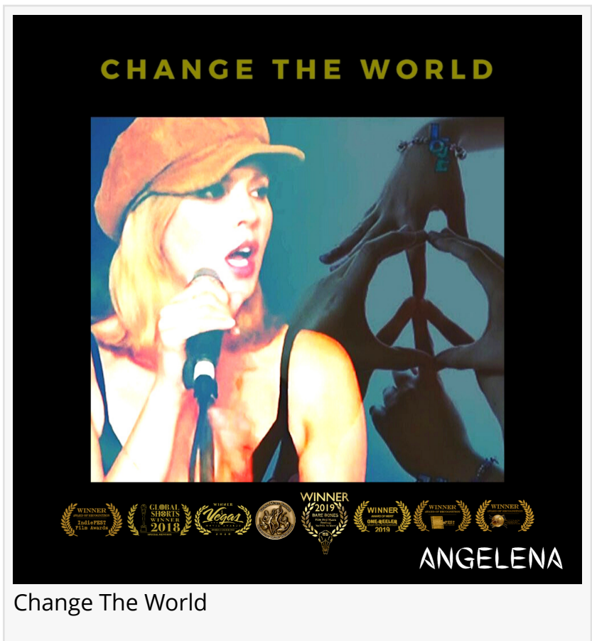
Change The World

then wrote the lyrics and melody to his music after his devastating death and during her time of deepest grief. Whilst living in Sydney's bohemian red light district of Kings Cross, they developed the sound of their music over a couple of years. Erick had also composed and produced music for various bands and soundtracks for Marvel Comics "Man Thing" and "Feed" directed by acclaimed Hollywood director, Brett Leonard ("Lawnmower Man" by Stephen King & Denzil Washington's "Virtuosity") before his sudden and unexpected death in August 2007. Angelena promised him whilst in a coma that someday, somehow she would finish their special project. She has kept her word and produced their album at Fox Studios Australia thirteen years later. The music she co-wrote with Deeby has become the soundtrack for her films and also won numerous 'Best Original Soundtrack' awards worldwide.