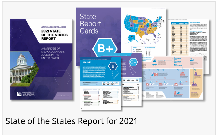
State of the States Report for 2021

WASHINGTON, DC, UNITED STATES, February 23, 2022 /EINPresswire.com/ -- Today, Americans for Safe Access (ASA) unveiled their annual report, " 2021 State of the States Report: An Analysis of Medical Cannabis Access in the United States. "