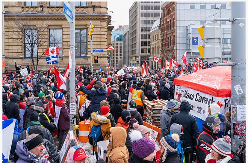
Freedom Convoy 2022