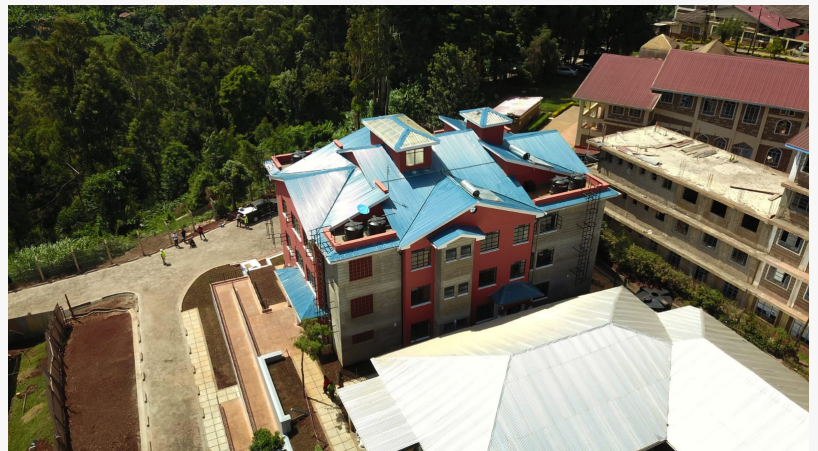
Aerial View of New Residence Hall at Clive Irvine College.