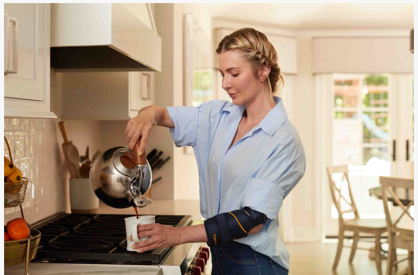
With a wireless rechargeable battery, infrared and red light therapy is easier to use than ever before.