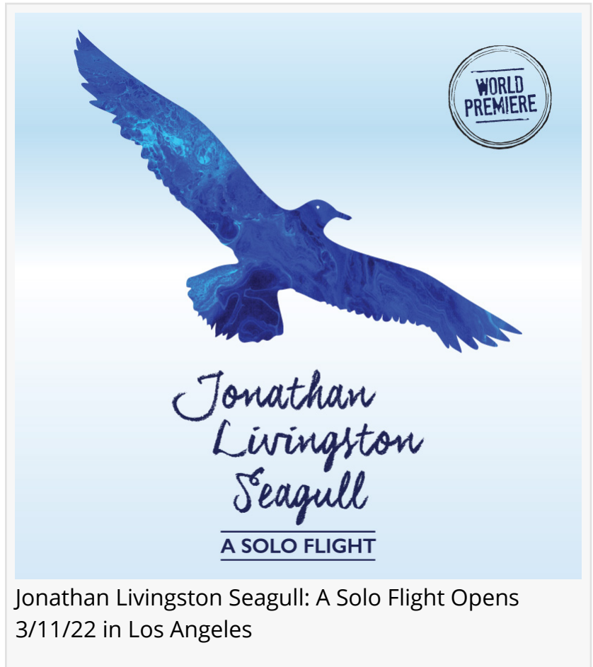
Jonathan Livingston Seagull: A Solo Flight Opens 3/11/22 in Los Angeles