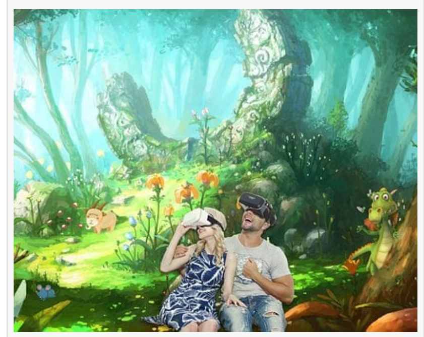
Teleport yourself into a fantasy world to take your mind off your troubles

a distraction that often take my mind off something I do not want to deal with and or think about. "Imagine if we can provide that outlet to escape the heavy burdens that must be carried? I want to be a 'ray in the rainbow' that takes them to a pot of golden exploration, wonder and discovery."