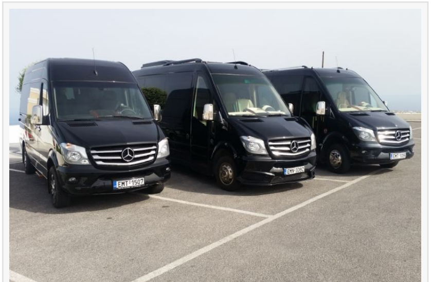
PRIVATE TRANSFERS SANTORINI TOURS

the museums, as it is the best way to see the ancient civilization buried under volcanic lava.