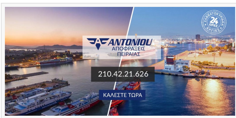
Apofraxeis Peiraias - Obstruction company

PEIRAIAS, ATHENS, GREECE, February 24, 2022 /EINPresswire.com/ -- Some insects like cockroaches, mosquitoes, and rodents like mice, rats pose a risk to public health by transmitting serious diseases to humans. It is worth mentioning that mosquitoes are responsible for causing the most human deaths from any organism on Earth.