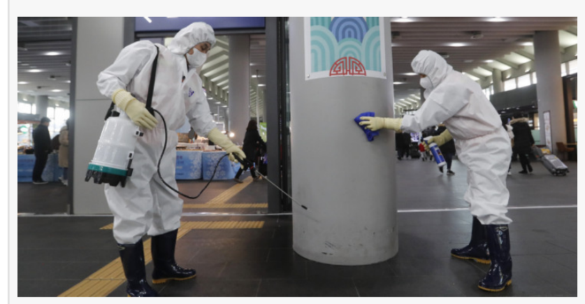
disinfestation, disinfection, and rodent control company