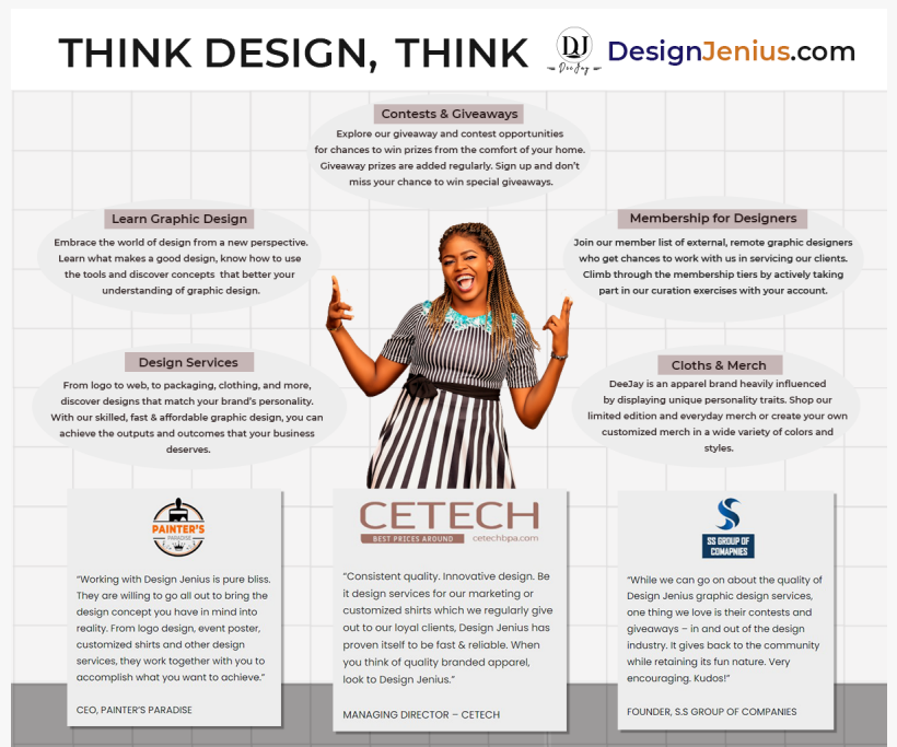
Design Jenius Services and Testimonials