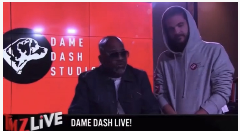
Roc-A-Fella Co-Founder Dame Dash Introducing Hassan to TMZ Founder, Harvey Levin