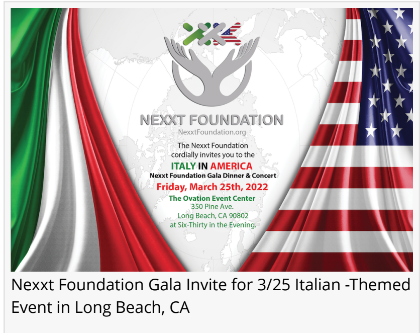
Nexxt Foundation Gala Invite for 3/25 Italian -Themed Event in Long Beach, CA

LONG BEACH, CA, USA, February 24, 2022 /EINPresswire.com/ -- Nexxt Foundation Inc. a Southern California based 501( c) 3 is pleased to announce its first annual all-star gala gourmet dinner and concert to be held at the Ovation Event Center in the Pine Ave District of Long Beach on the evening of Friday, March 25th, 2022, with a portion of the proceeds benefiting the local, Orange County based Somerset Homes .