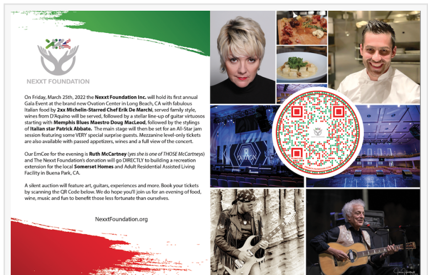
Nexxt Foundation 3/25 Gala Chef & Performers

For more information on Nexxt Foundation and to receive updates please click here