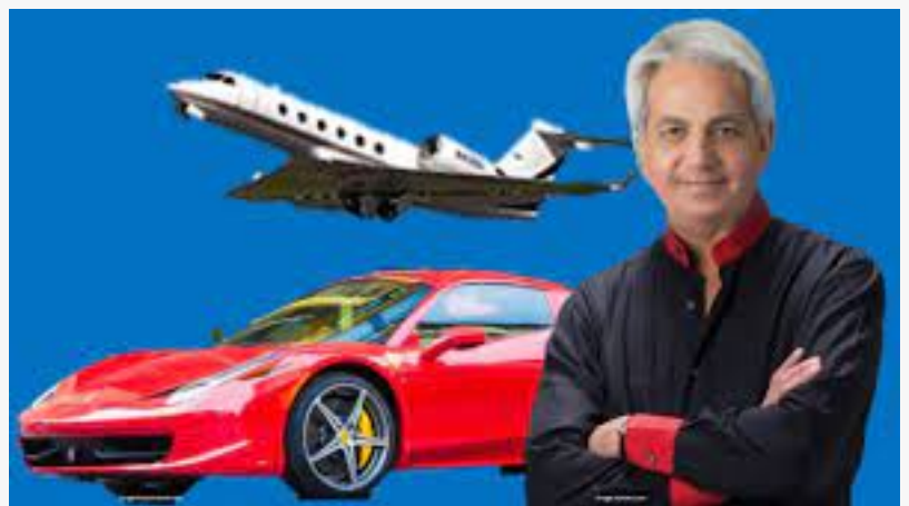
Doing God's Work Tax free

Getsemani – a church that serves one of the poorest communities in the State of California. For decades, he has provided – continues to provide - food, shelter, clothing and social services to millions around the world as well as those in his own community.