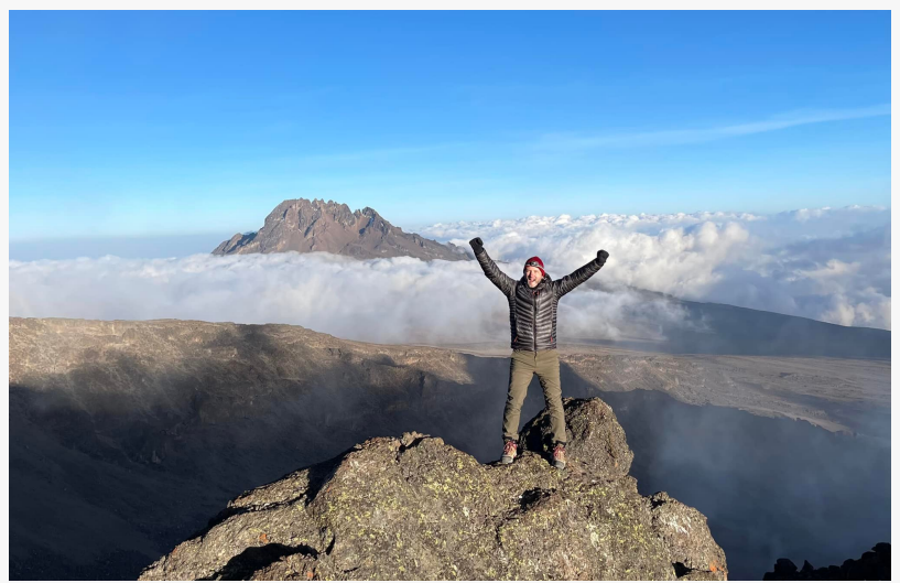
Brandon Heath is pictured after reaching the top of Mt. Kilimanjaro last month.

Signed last year to both Centricity Music and Centricity Publishing, all the latest Brandon Heath music, tour and more news, can be found at: