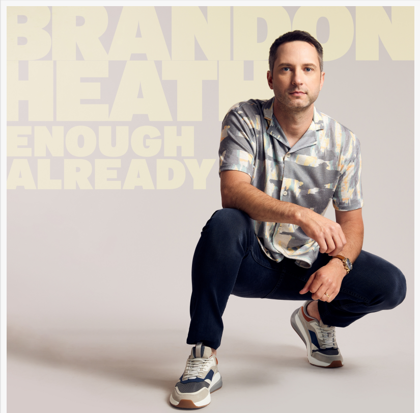
Brandon Heath, Enough Already album cover artwork.

"I've heard it said before that music is medicine, but I don't see myself as a pharmacist. I don't see myself as a healer. But what I do see myself as is a sharer," says Heath, a storyteller whose songwriting grapples with faith and doubt simultaneously. "I can't sit down and write a prescription for anybody, but I can share some of my own pain and my own perspective, and that connection, I think, is what makes people feel the healing."