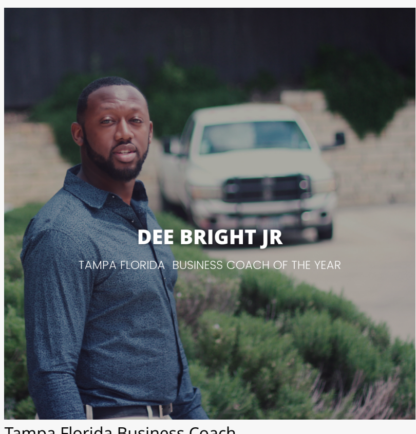
Tampa Florida Business Coach