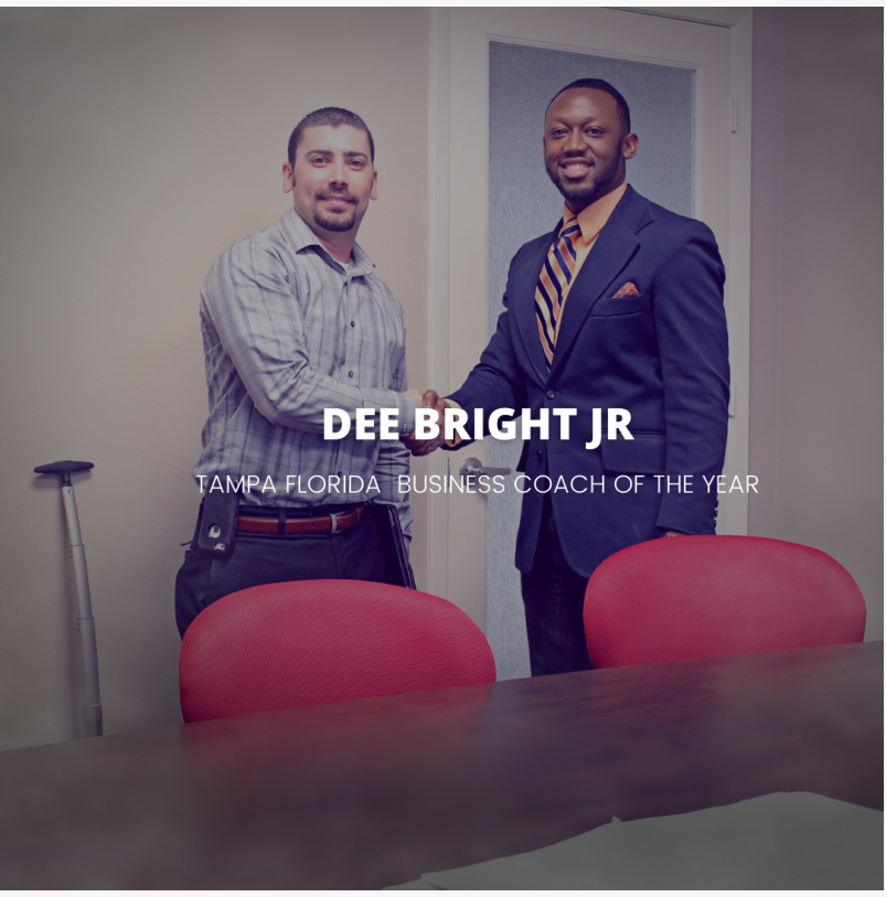
Tampa Florida Business Coach