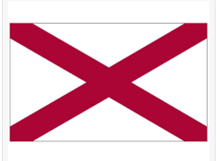
In Alabama's May 24 Crossover Primary--No Party Restrictions for Voting