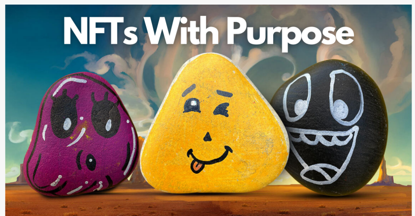
NFTs with Purpose

Pebble Art is not just a profit-seeking business; it is a movement driven by the noblest cause of educating the under privilege children across the globe. The movement is initiated by a talented