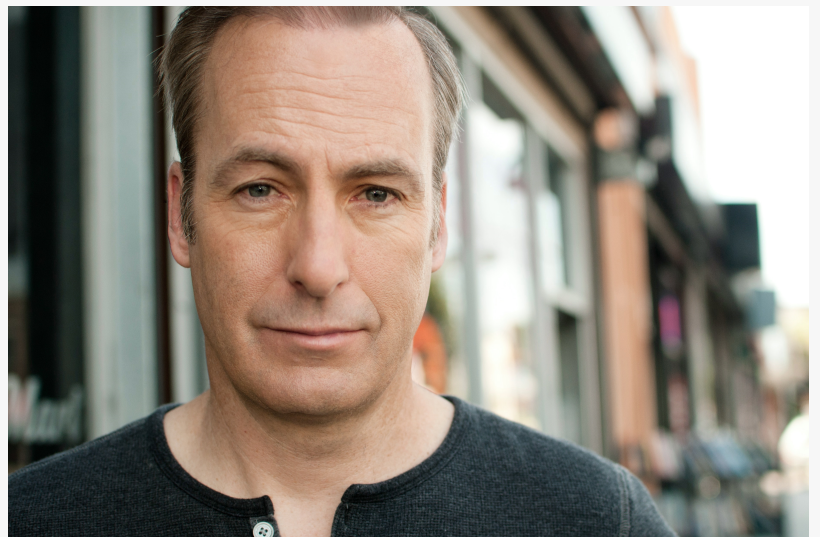
Actor Bob Odenkirk of "Better Call Saul" and "Breaking Bad" talks about his unplanned career in a new memoir.