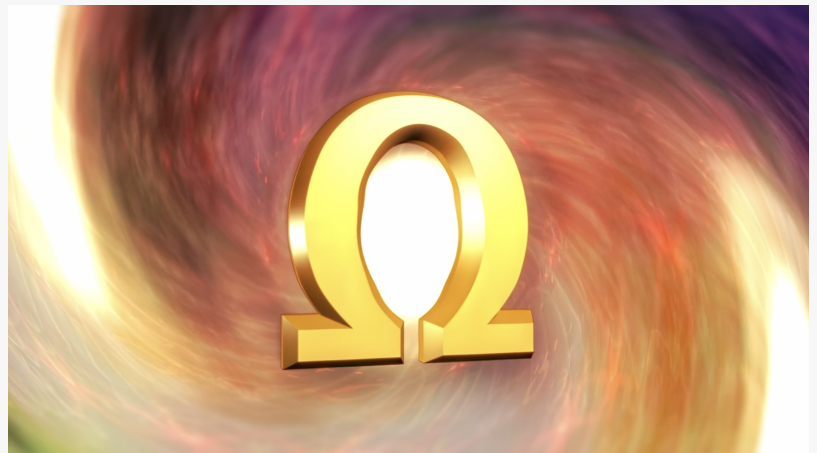
A still frame from the 130 million dollar \Omega NFT, available at superrare.com

This press release can be viewed online at: https://www.einpresswire.com/article/564237938