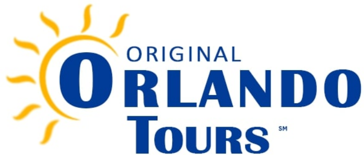
OOT Primary logo