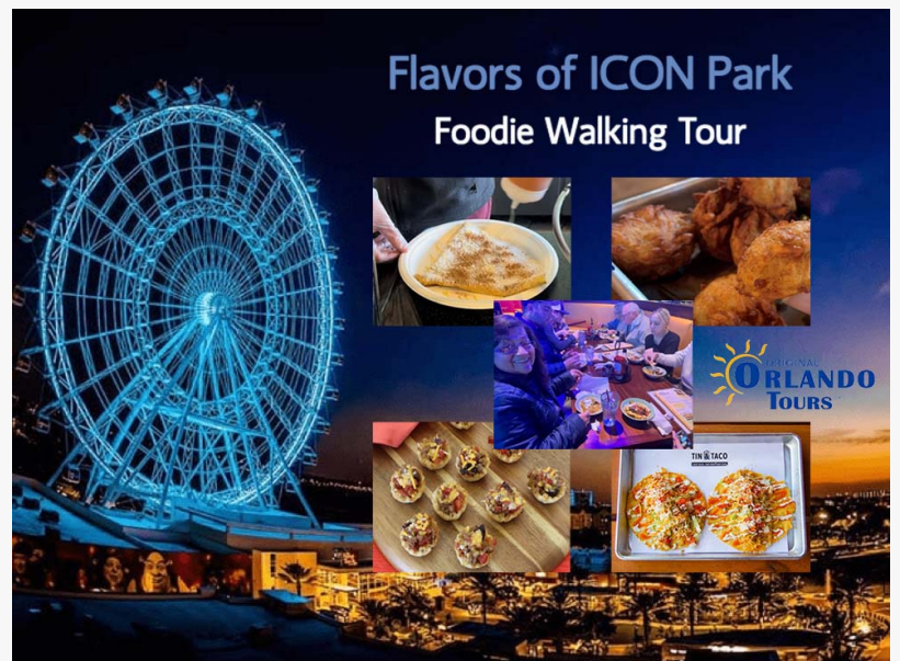
Plenty of delicious items to sample on the Flavors of ICON Park Tour Foodie Walking Tour