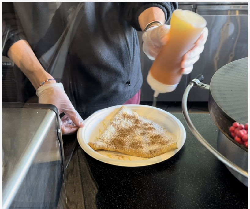
Chef at iCafe de Paris makes a strawberry, banana and Nutella crepe for guests on the Flavors of ICON Park Foodie Walking Tour