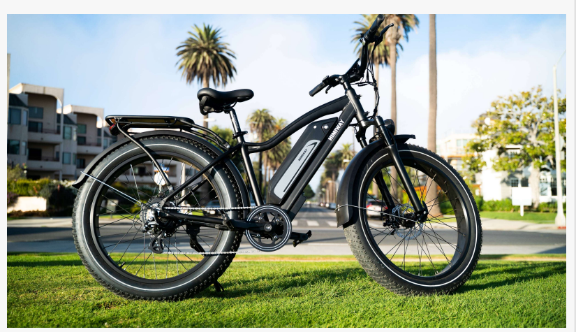
Himiway fat tire E-bike