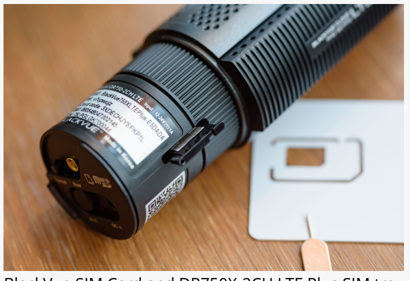
BlackVue SIM Card and DR750X-2CH LTE Plus SIM tray

With the BlackVue SIM Card, users only need to create a free BlackVue Cloud account and follow a few simple steps