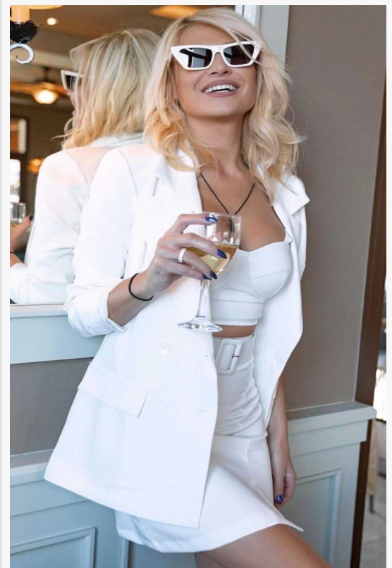
Spring - Summer 2022 - DkStyle Fashion Trends