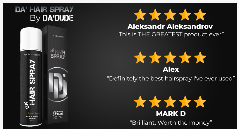
Amazon UK reviews