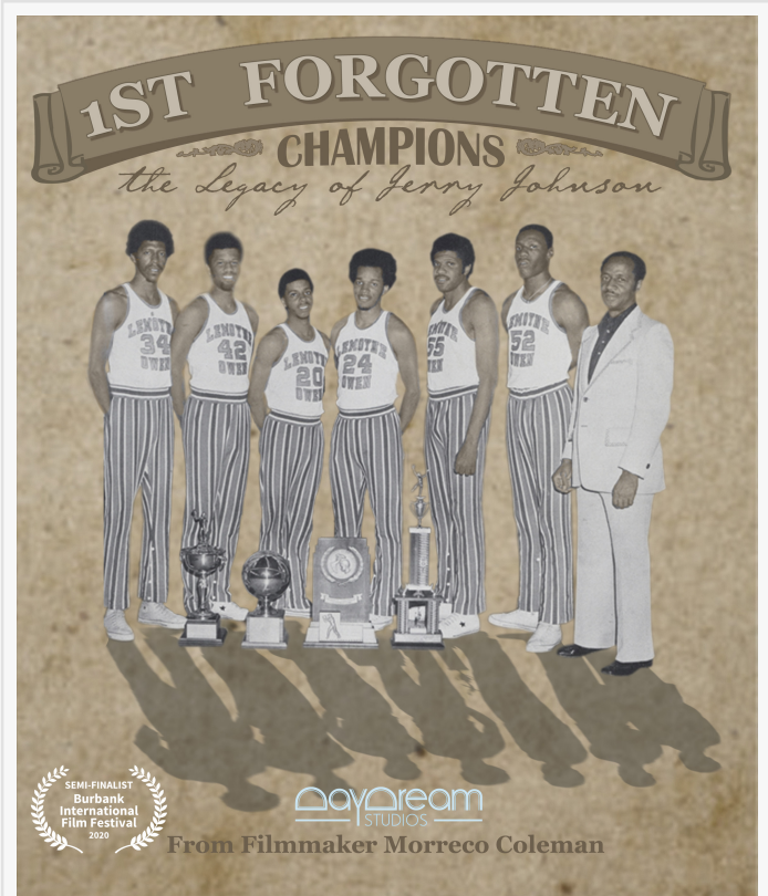
1st Forgotten Ones Poster