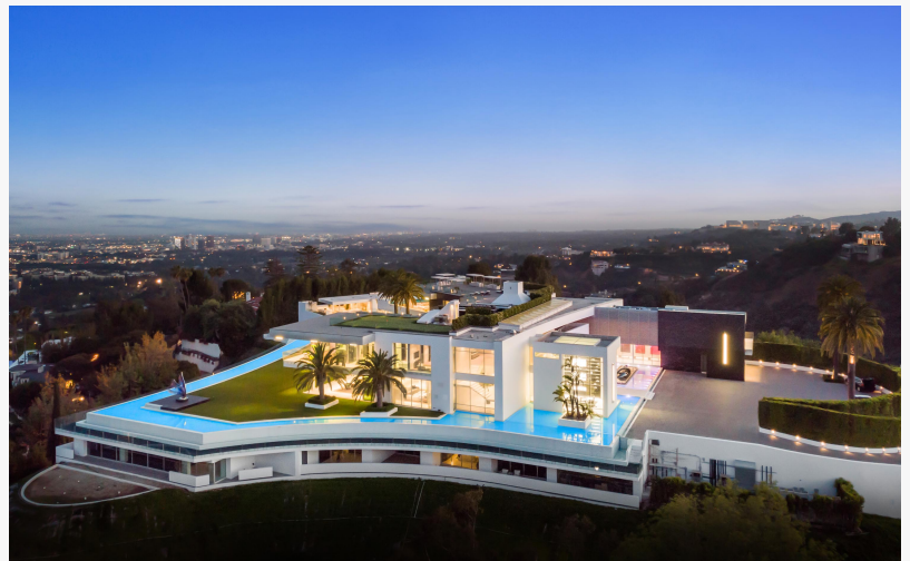
The largest and one of the most expensive private residences in the world, bidding is now open on The One.