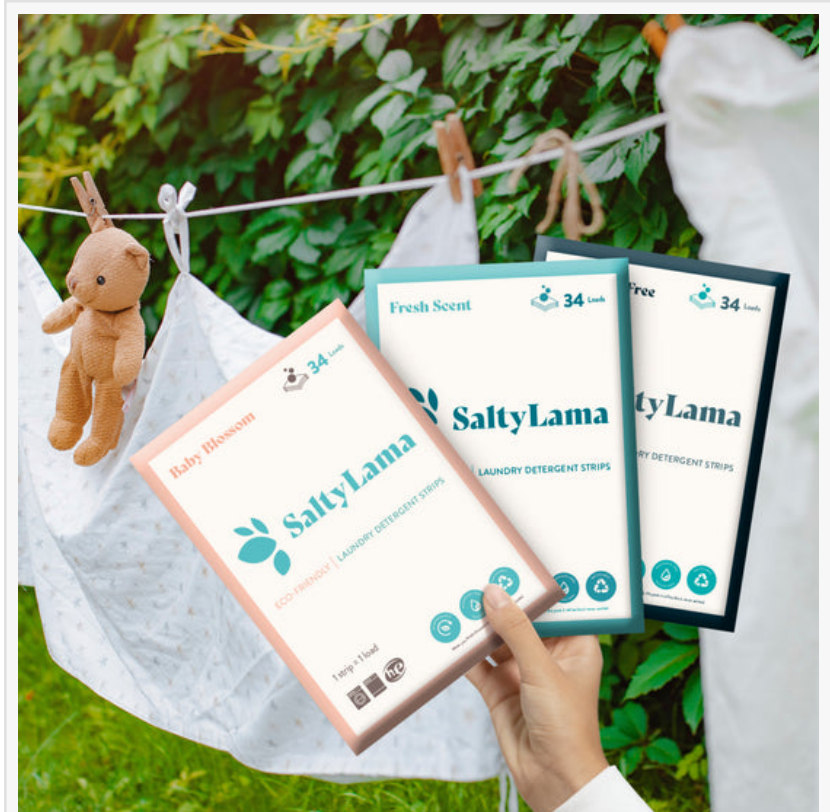
SaltyLama eco-friendly laundry strips

“Consumers can now have the confidence of buying a product that they know will work, as well