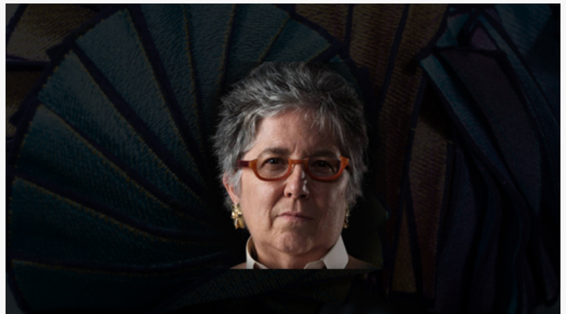
Special Art Exhibition by Contemporary Artist Susan Hensel