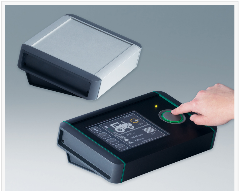
SMART-TERMINAL enclosures - new canting kit for desktop electronics applications.

BRIDGEVILLE, PENNSYLVANIA , USA, March 1, 2022 /EINPresswire.com/ -- The SMART-TERMINAL series is a stylish and sophisticated handheld, desktop and wall-mount enclosure for peripheral and interface equipment; office and communications technology; safety engineering; biometrics; medical and laboratory technology; automation, Smart Factory and Industry 4.0; gateways; measurement and control engineering.