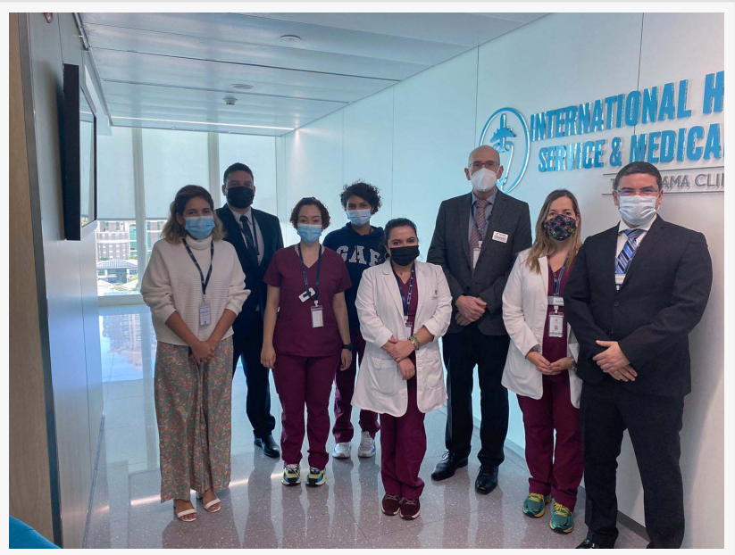
The Quality Team at The Panama Clinic with Temos assessors

Founded in 2010, Temos accredits hospitals and clinics, ambulatory care/urgent care centers, dental services, cosmetic surgery clinics, IVF and reproductive health clinics, physical rehabilitation services, eye care clinics and hospitals, and community pharmacies. As an industry thought leader, Temos offers ISQua-EEA accredited programs designed by experts for the specific services delivered and the patients served. With clients on five continents, the company