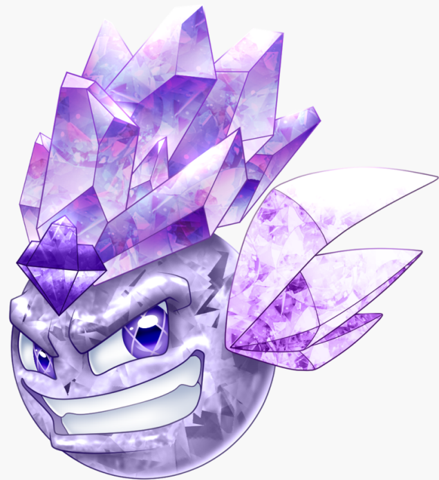
NFT Vaffa Cosmo