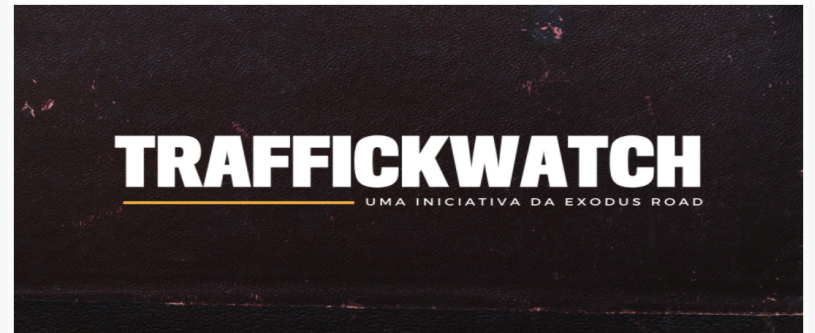
The Exodus Road launches TraffickWatch Academy: Brazil

human trafficking crime. The Exodus Road's TraffickWatch Academy: Brazil features educational videos of trafficking experts from Brazil and the U.S. discussing how to collect and act on evidence of human trafficking to enable the prosecution of traffickers and liberation of survivors.