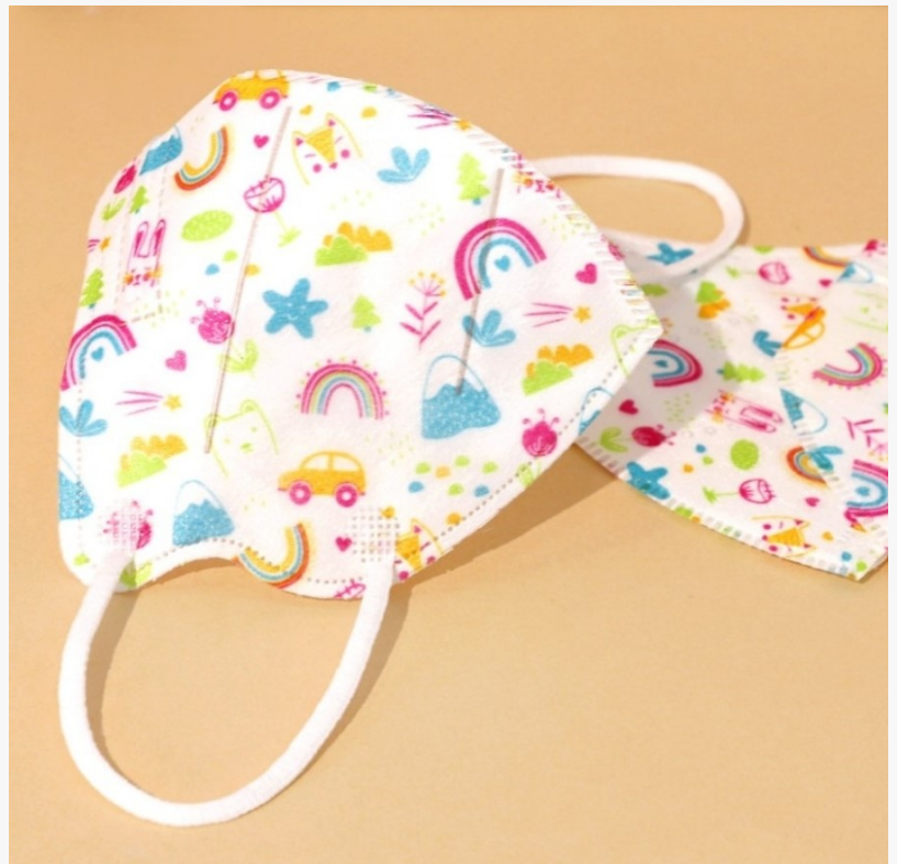
Aegle Kids Junior