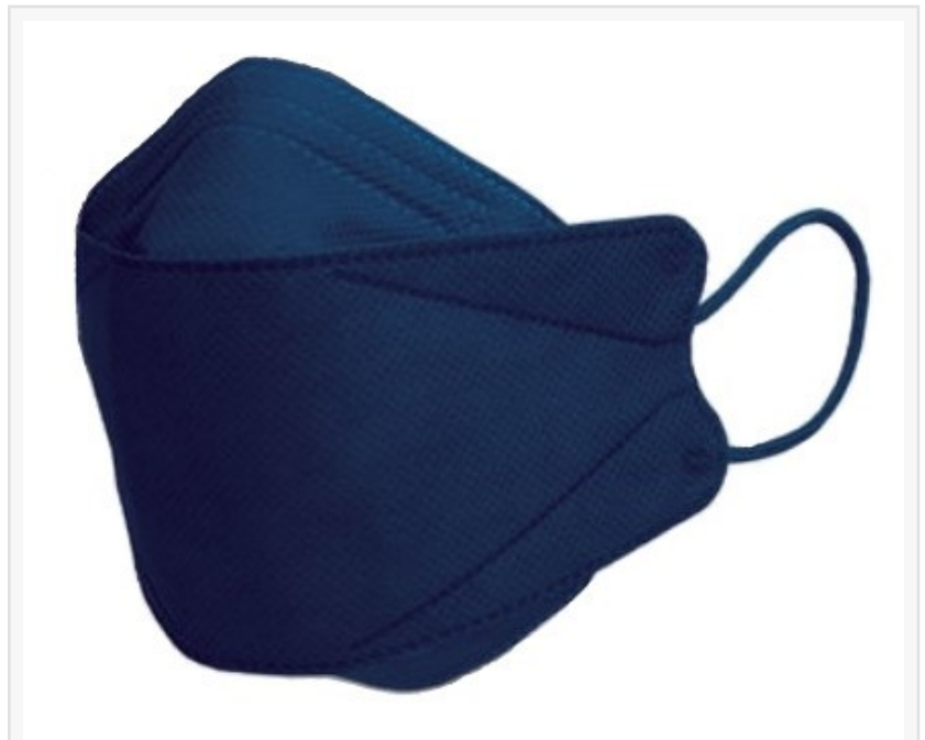
Aegle Kids Blue

The Aegle Kids' masks are expected to begin shipping on or before April 1st. Parents interested in purchasing masks for their children can visit https://aegleco.com/products/kids-mask-presale-1 to order masks.