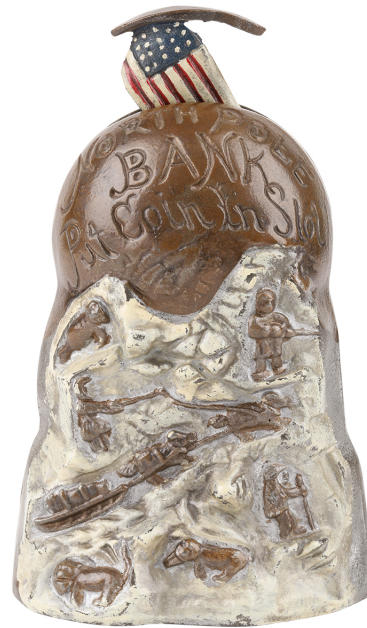
Scarce early 20th century J. & E. Stevens mechanical bank, depicting reliefs of Robert E. Peary's 1909 expedition to reach the North Pole, patented in 1910 (est. CA$6,500-$9,000).

An Austrian court cabinet clock from the 1870s, an imposing corner court cabinet with an integral clock feature and a case boasting numerous cast brass embellishments, plus an inside containing silverware drawers, should realize $3,000-$4,000; while a Canadian Pequegnat "Regulator #1" office clock from the 1910s, Pequegnat's most accurate timekeeper, with an 8-day weight-driven movement and a quarter sawn oak case, has an estimate of $2,500-$3,500.