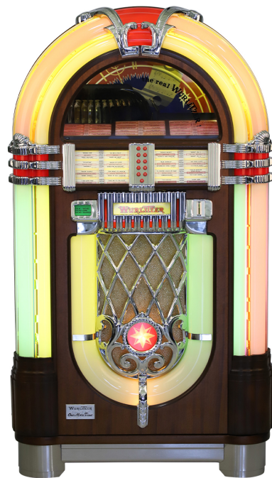
Replica of the iconic 1946 Wurlitzer Model 1015 "One More Time" ("OMT") jukebox, made in Germany around 1990 and updated to play 45 rpm records (est. CA$4,000-$6,000).

was designed to look like the cars of the era, with big fins and a windshield. The jukebox is in good working order (mono only) and plays up to 120 selections of 45 rpm records.