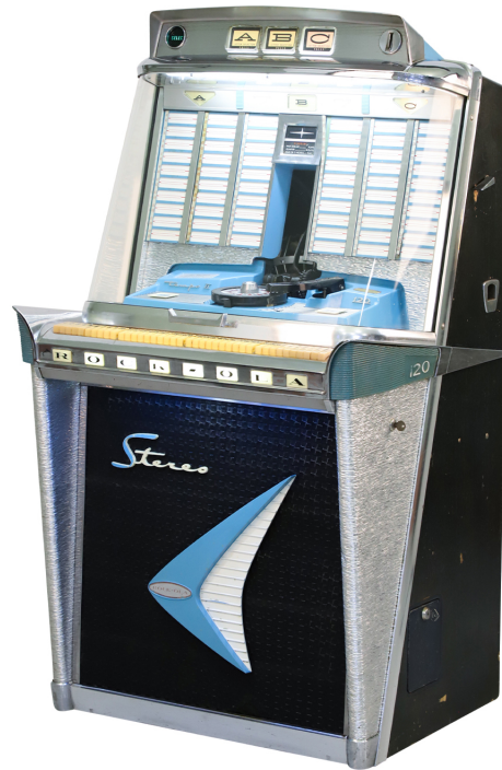
1960 Rock-Ola Tempo II Model 1478 jukebox, nicknamed the "Windshield" because it was designed to look like cars of the era with big fins and windshield (est. CA$3,500-$5,000).