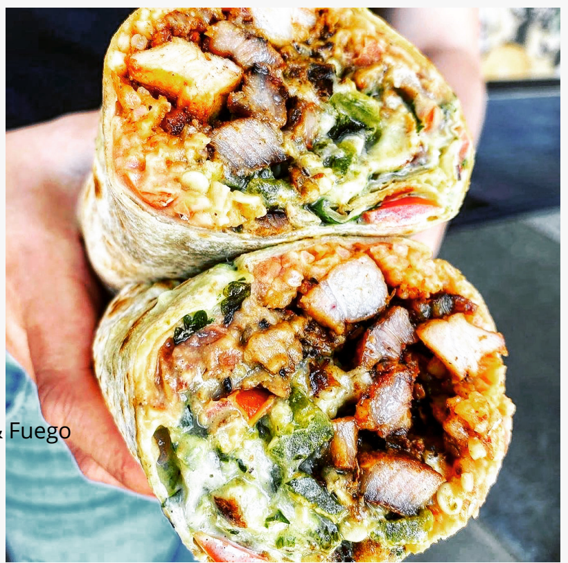
Chile Relleno Burrito