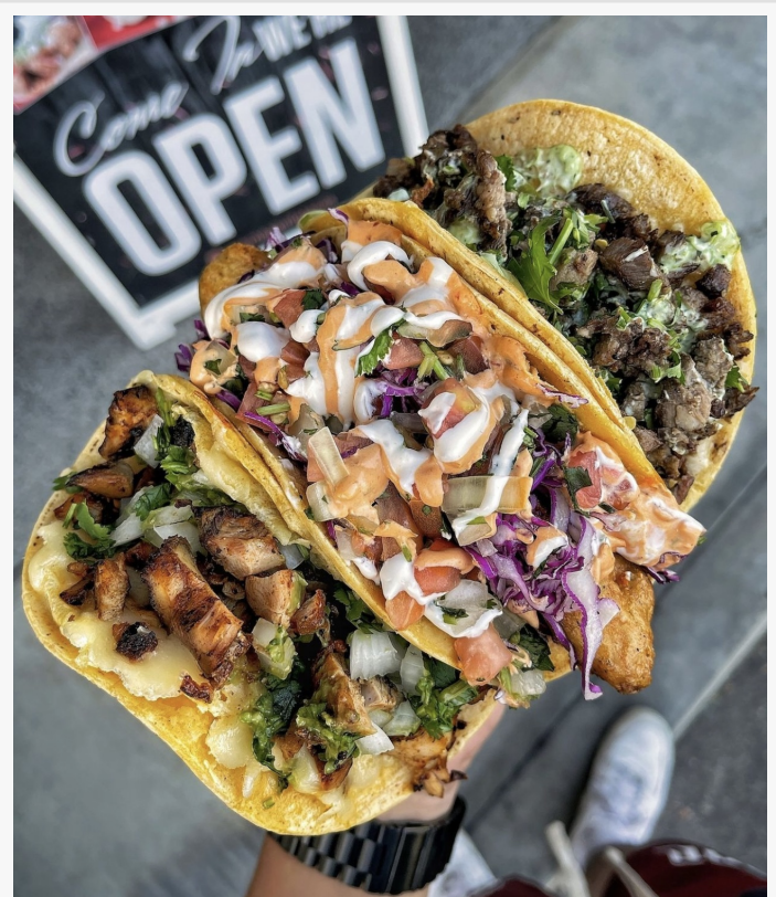
Los Tres Amigos

Mezquite Tacos & Fuego offers a menu full of delicious options from delicious tacos to a variety of hometown favorites. New items on the menu that are very unique and desirable. After eating the sizzling asada meat or the savory chicken straight from the grill and the pastor from the fiery pit, it will be difficult not to go back and try the rest of the menu.