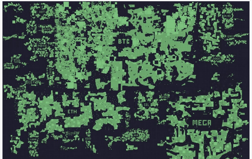
The Megaverse Map