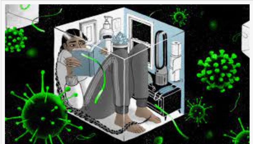
— BIOLOGICAL ENLIGHTENMENT IN LESS THAN 3 MINUTES — A Must-See "Time-Lapse" Video (view below)