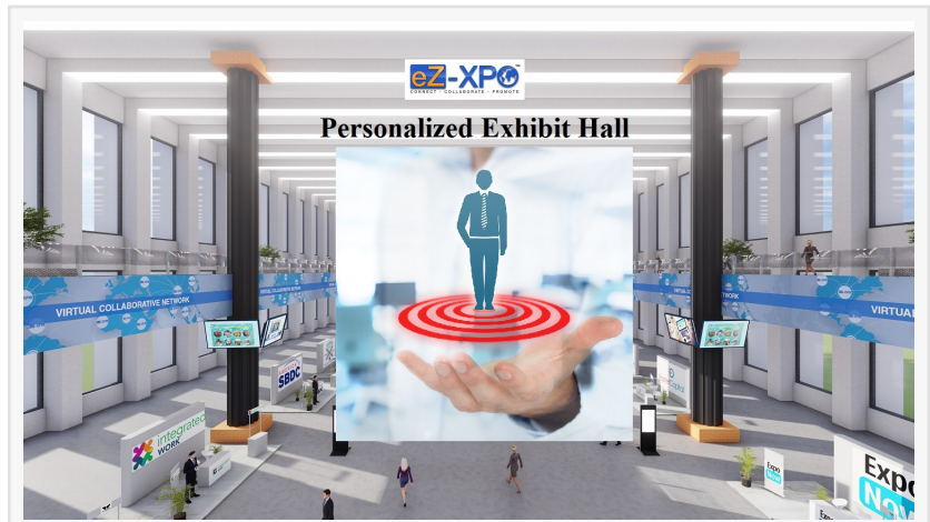
Virtual Exhibit Hall

GTN365 is also offering a special FREE subscription to Ukraine companies or exhibition organizers to thrive during the current challenging crisis. Please contact Matt Fok at mfok@ez-xpo.com .