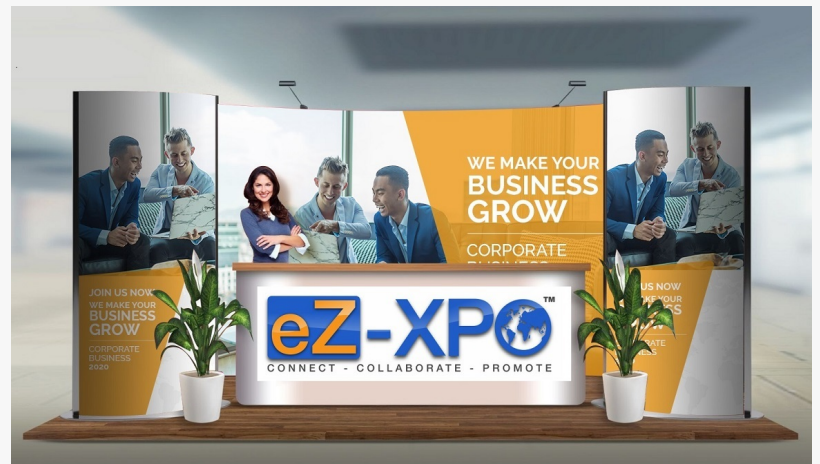
Virtual Booth for Trade Show, Classroom and Job Fair