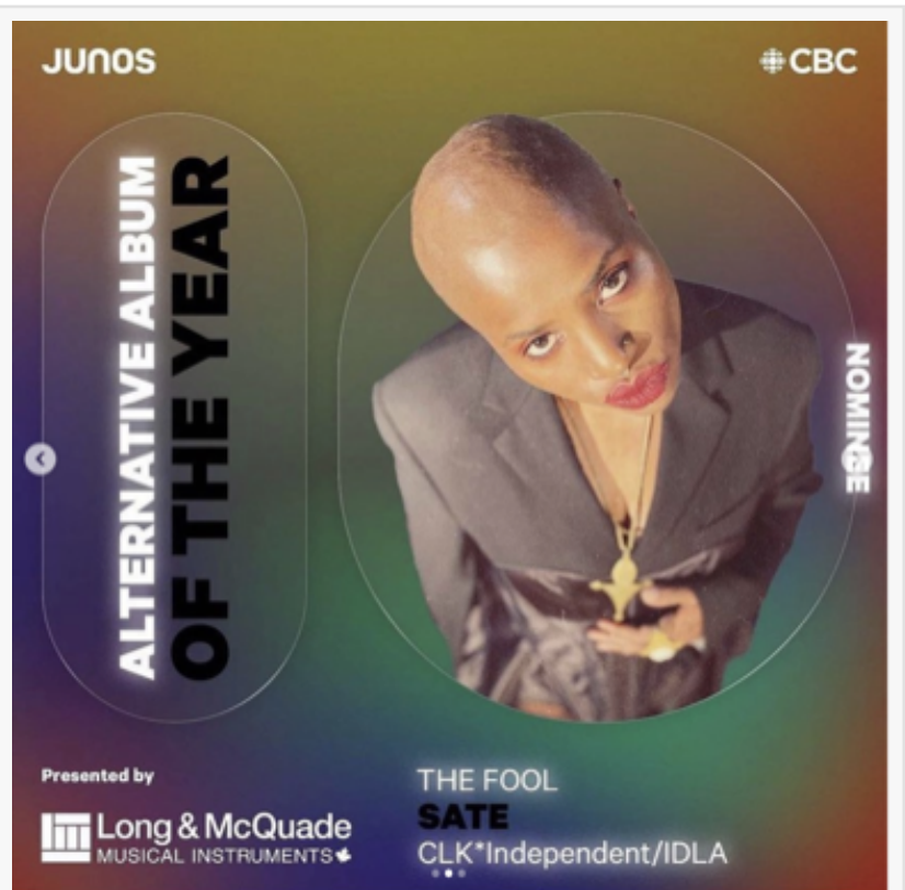
SATE JUNO Nomination

CCS Rights Management is a global independent music publishing and rights administration company providing a full range of services to its roster of award-winning, established and up-and-coming songwriters, artists, musicians, producers, and labels, as well as global media and production companies, and corporate brands. The company manages more than 150,000