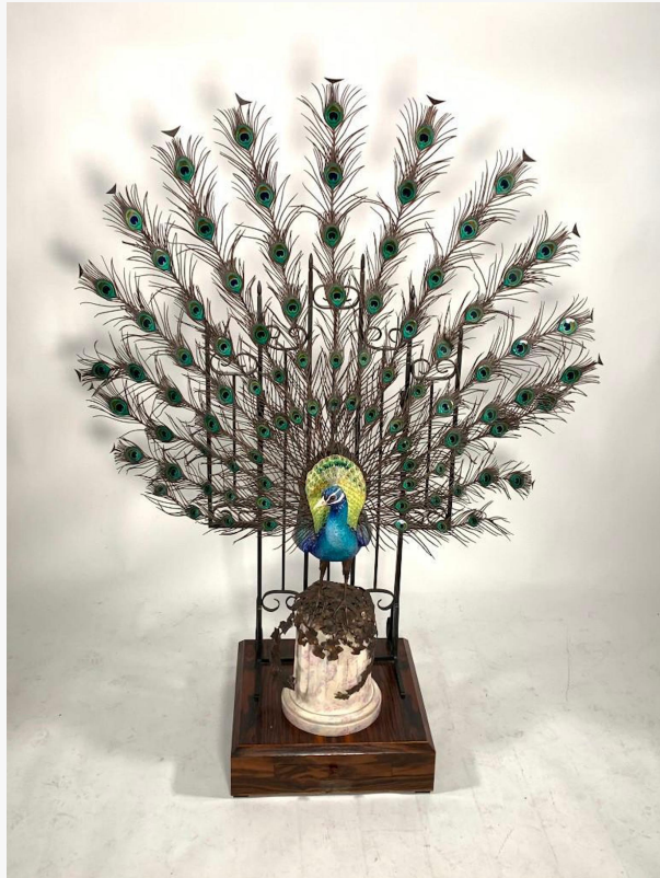
Spectacular Albany of England porcelain, bronze and enamel peacock on a stand, 60 inches tall, the bronze bird brightly glazed in turquoise, cobalt blue and lime green ($5,842).

Cynthia Maciejewski Neue Auctions +1 216-245-6707 email us here