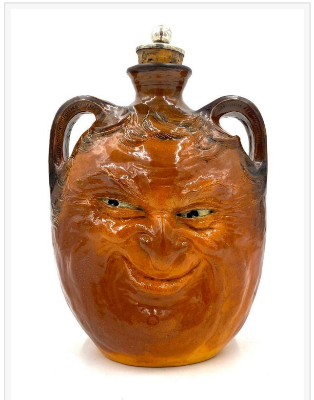
Double-handled face flask by R. W. Martin and Brothers (British, 1873-1914), made in 1901 and depicting a grinning character face; obverse inscribed with a poem regarding a potter ($12,300).

On Saturday, April 30th, Neue Auctions will hold an online-only Fine Interiors Auction, also at 10 am Eastern. Many antiques, fine paintings and decorative objects will be offered in addition to furniture by such names as Baker and Henredon, beautifully upholstered chairs, ottomans, side, lamp and coffee tables, lighting, mirrors and decorative items from some of the best homes east