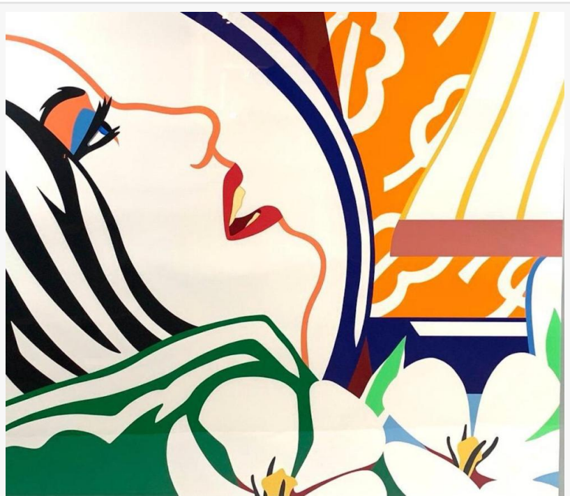
Screenprint in colors by Tom Wesselmann (American, 1931-2004), titled Bedroom Face with Orange Wallpaper (1987), 62 inches by 68 inches, framed, signed, dated, numbered ($12,300).

A pair of face-related lots each posted a selling price of $12,300. One was a screenprint in colors by Tom Wesselmann (American, 1931-2004), titled Bedroom Face with Orange Wallpaper (1987), 62 inches by 68 inches as framed and signed, dated and numbered. The other was a double-handled face flask by R. W. Martin and Brothers (British, 1873-1914), made in 1901 and depicting a grinning character face. The obverse was inscribed with a poem regarding a potter.