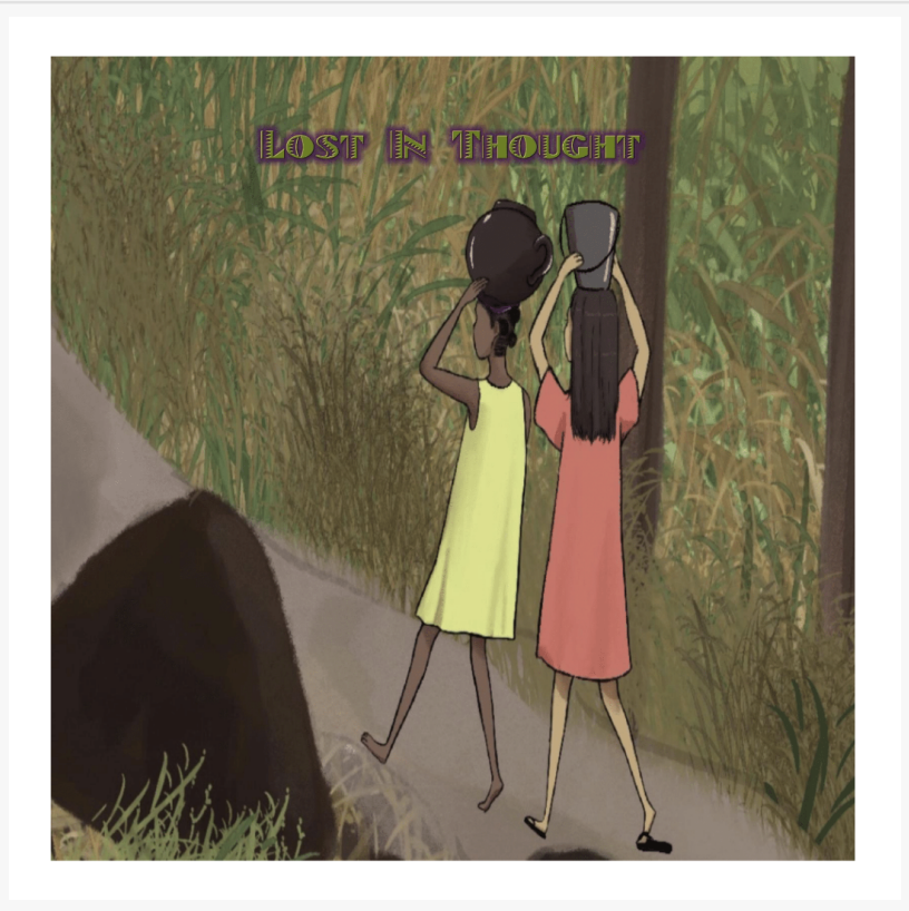
The photo shows how African children balance water vessels on their heads

Anselm Anyoha Modern Era Pediatrics +1 203-209-7355 email us here Visit us on social media: Facebook Twitter LinkedIn