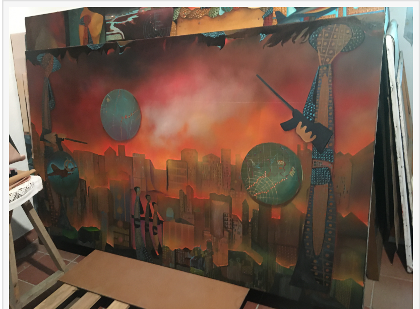
Oil on canvas by Ruffo Caselli: A new kind of war, showing one of his iconic robots holding a gun and two distant words in war.

Reality is often described better with images than words. Cybernetic Existentialism takes perspectives from the philosophy of Existentialism and combines them with insights from the