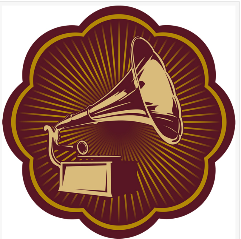
Digital Victrola Records