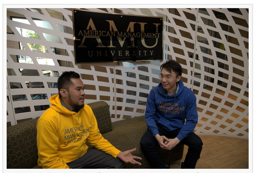
AMU students sit in front reception area of main campus office

Businesses have been obliged to adopt a distant setting due to the numerous health issues in the past two years. The importance of strong management and leadership abilities shines through in these digital meetings and online interfaces. Many organizations are looking for employees who can manage company projects and are